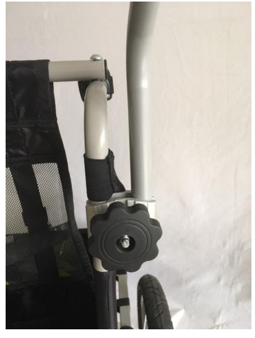
Single Child Configuration Handlebar to Outside of frame

NOTE : When preparing for installation of the stroller handlebar, please make sure you assemble correctly for single child or double child models. See pictures below for guidance: