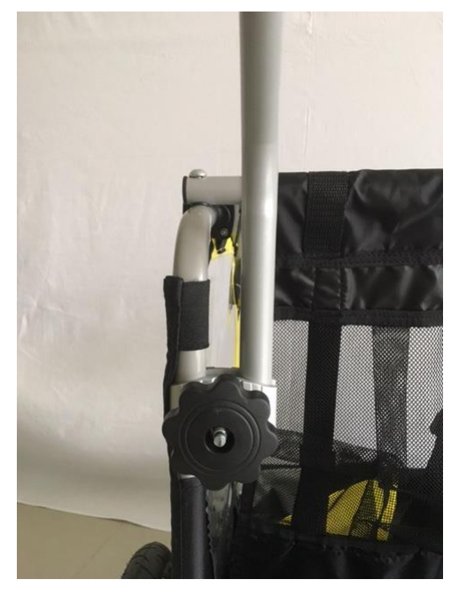
Double Child Configuration Handlebar to Inside of frame

Before starting out, loop the included wrist strap around the handlebar as shown. Always use the safety wrist strap when pushing your child in the stroller. This feature allows you to remain in control of the trailer in the event of a fall or sudden distraction.