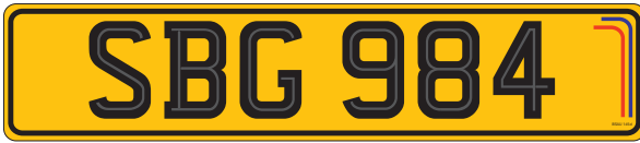
Borders and letters