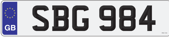
GB Euro and 3D digit